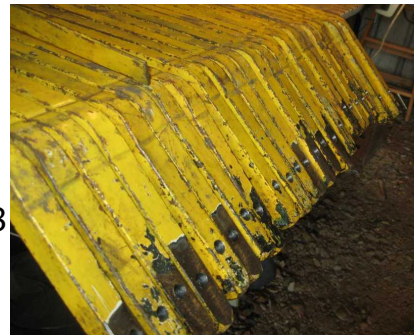
All the legs with the new cotter pin holes drilled in them.