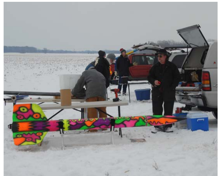
Parking and rocket prep