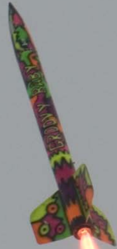
Heading down range